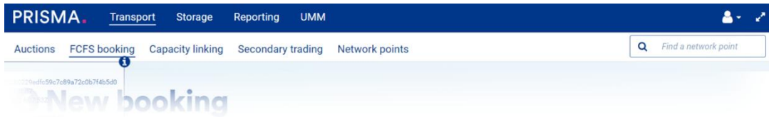
Figure 2 : Go to the FCFS booking menu